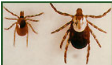
Female Deer Tick (left) Female Dog Tick (right)