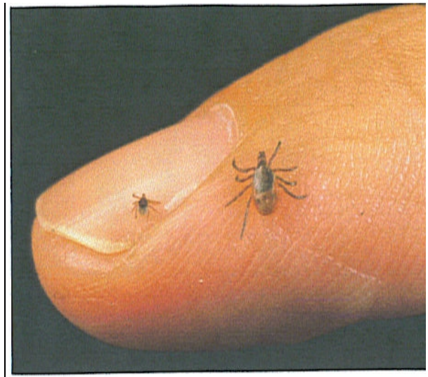
nymph and adult deer tick on a finger